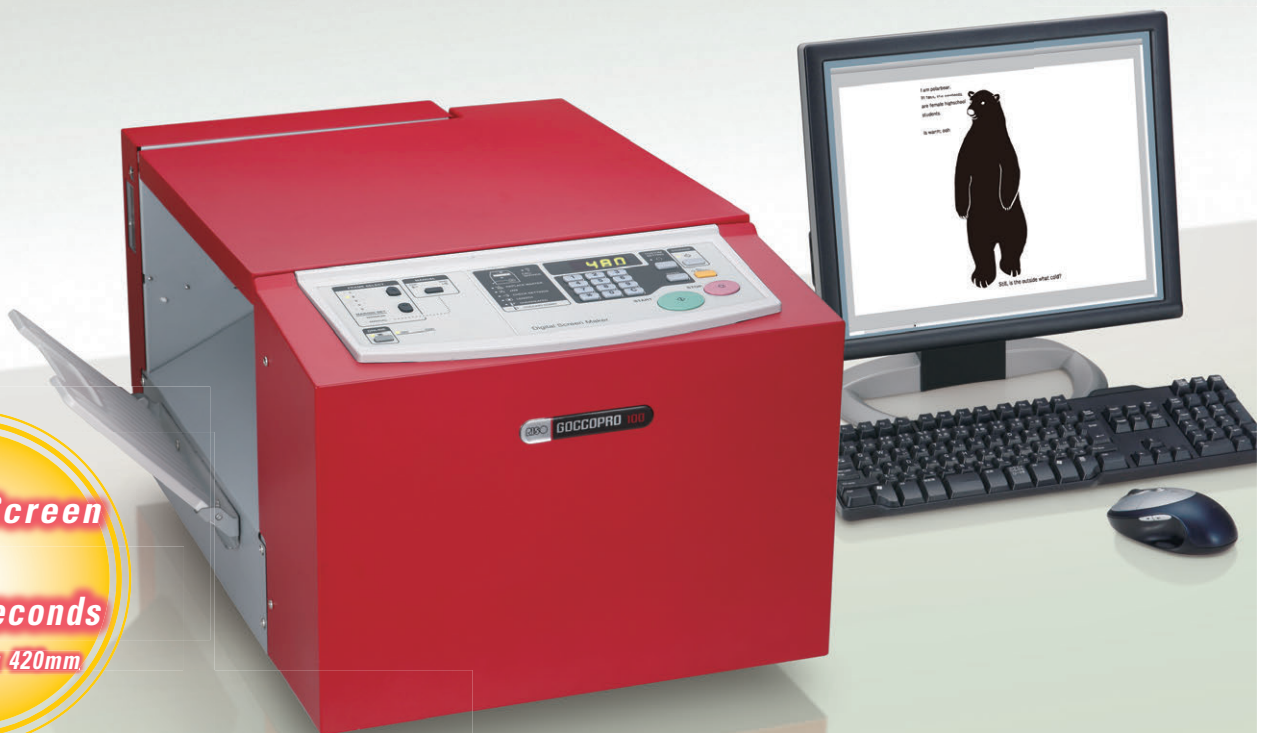
Image to Screen

NO Chemicals NO Emulsions NO Darkroom NO Water NO Film Positives